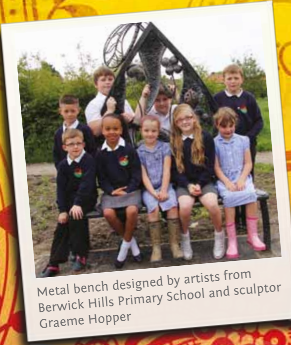
Metal bench designed by artists from Berwick Hills Primary School and sculptor Graeme Hopper