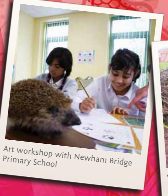
Art workshop with Newham Bridge Primary School