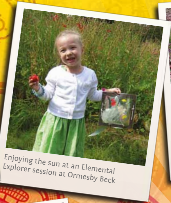
Enjoying the sun at an Elemental Explorer session at Ormesby Beck