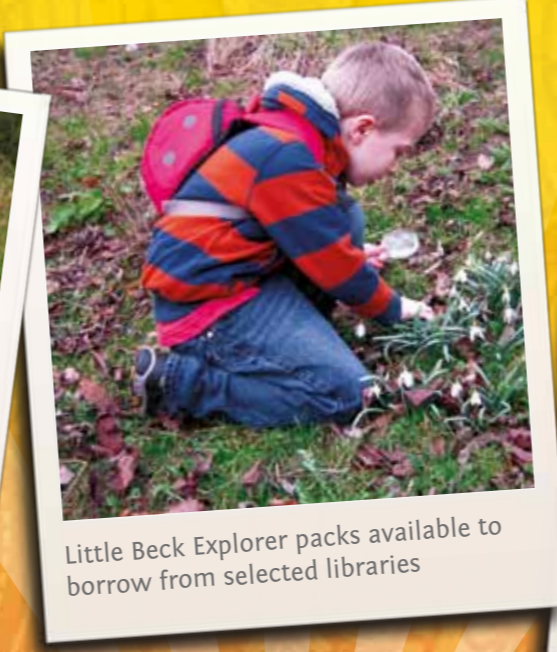
Little Beck Explorer packs available to borrow from selected libraries