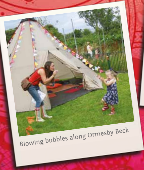
Blowing bubbles along Ormesby Beck