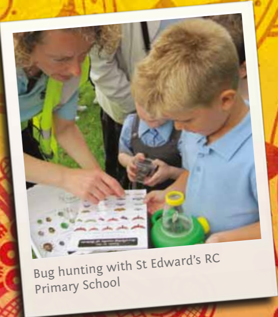
Bug hunting with St Edward's RC Primary School