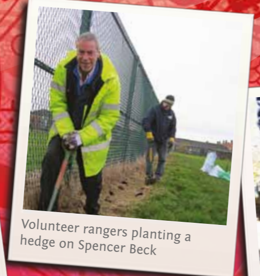
Volunteer rangers planting a hedge on Spencer Beck