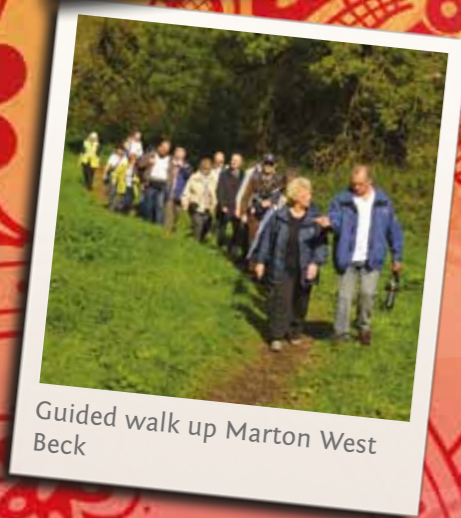
Guided walk up Marton West Beck