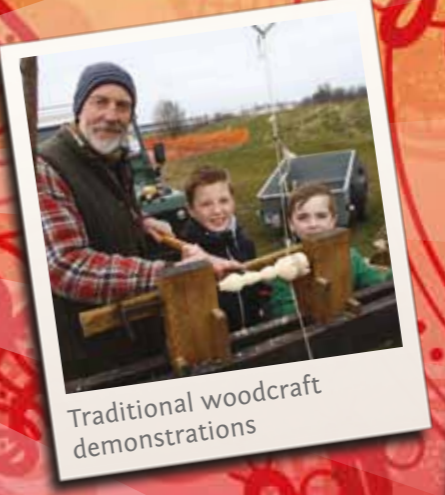
Traditional woodcraft demonstrations