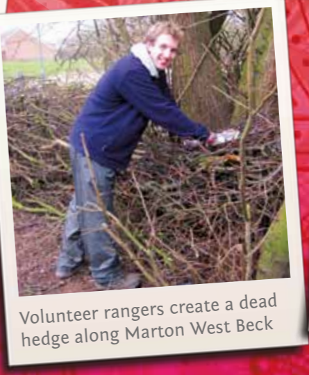
Volunteer rangers create a dead hedge along Marton West Beck