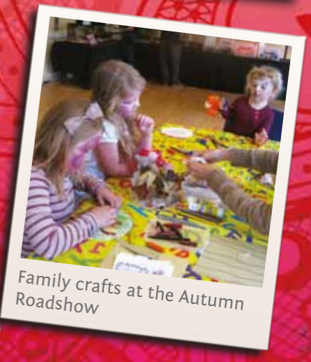
Family crafts at the Autumn Roadshow