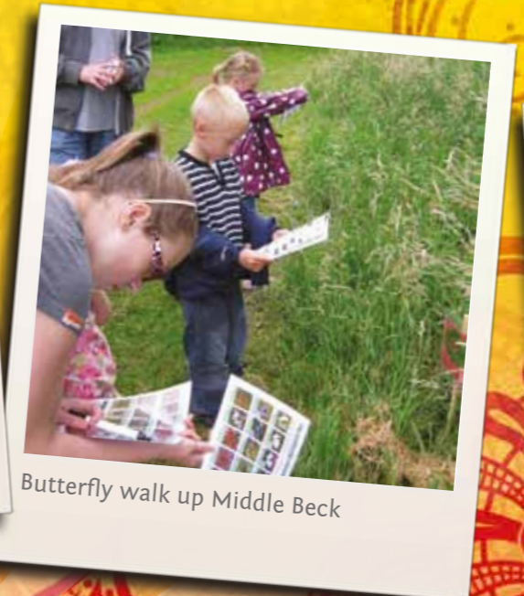
Butterfly walk up Middle Beck