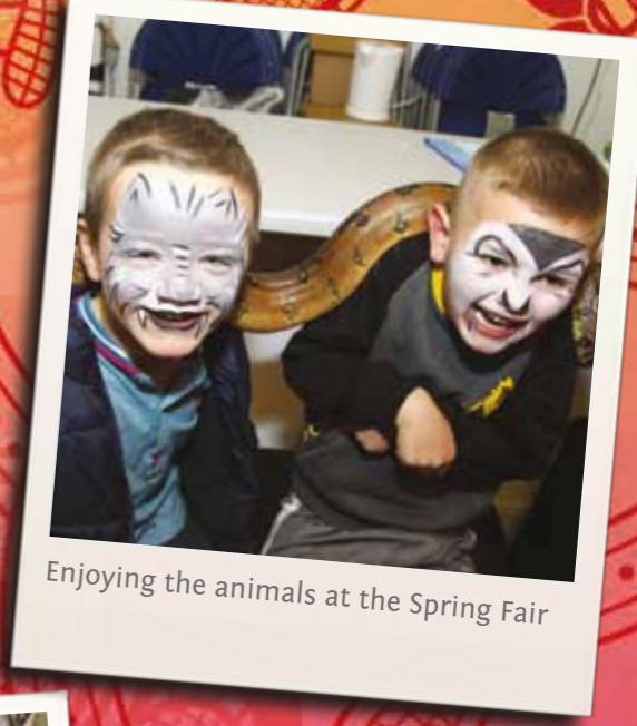
Enjoying the animals at the Spring Fair