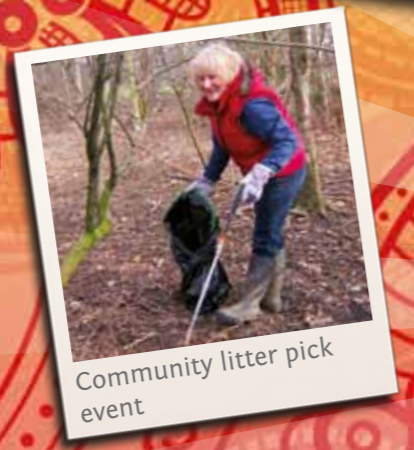
Community litter pick event